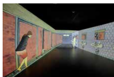
public conVENience(2006) photo:Hiroataka Yonekura ©Tabaimo / courtesy of Gallery Koyanagi