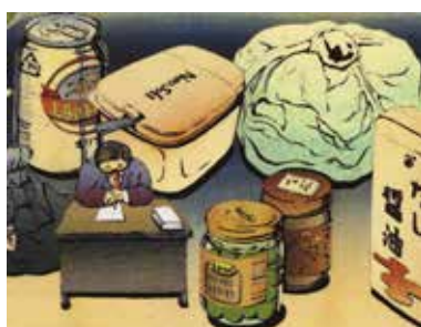
Japanese Kitchen(1999) still image ©Tabaimo / courtesy of Gallery Koyanagi