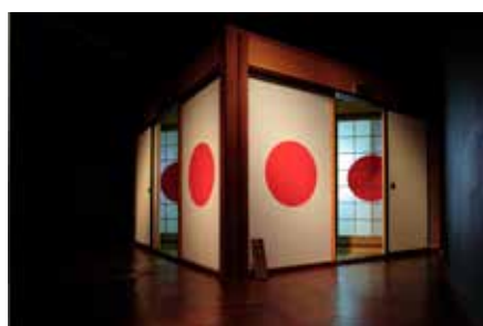
Japanese Kitchen(1999) photo:Hiroataka Yonekura ©Tabaimo / courtesy of Gallery Koyanagi

Scheduled major solo exhibition at MCA, Australia in 2014.