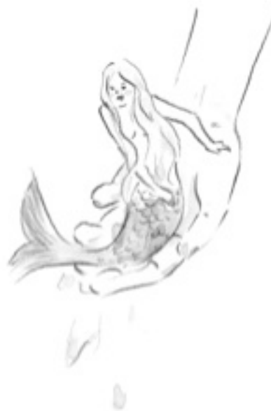
left: from 『カーサの猫村さん』 / right: from 『ビーチ』