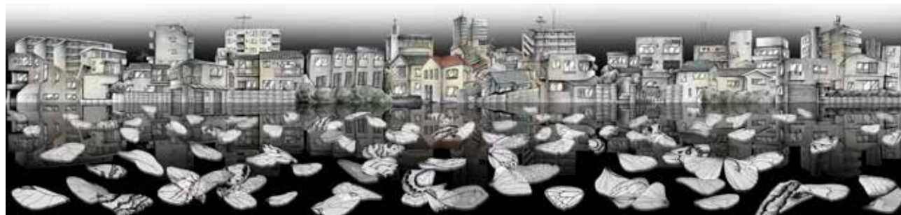
teleco-soup(2011) still image ©Tabaimo / courtesy of Gallery Koyanagi